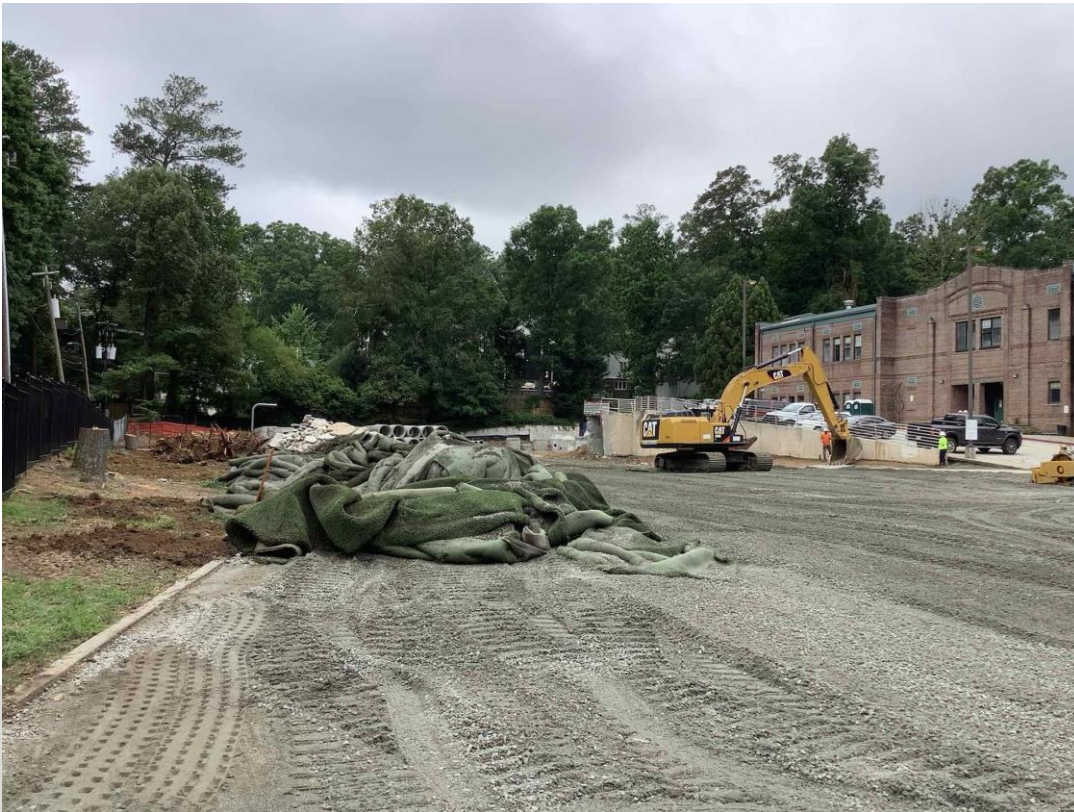
Existing turf removal