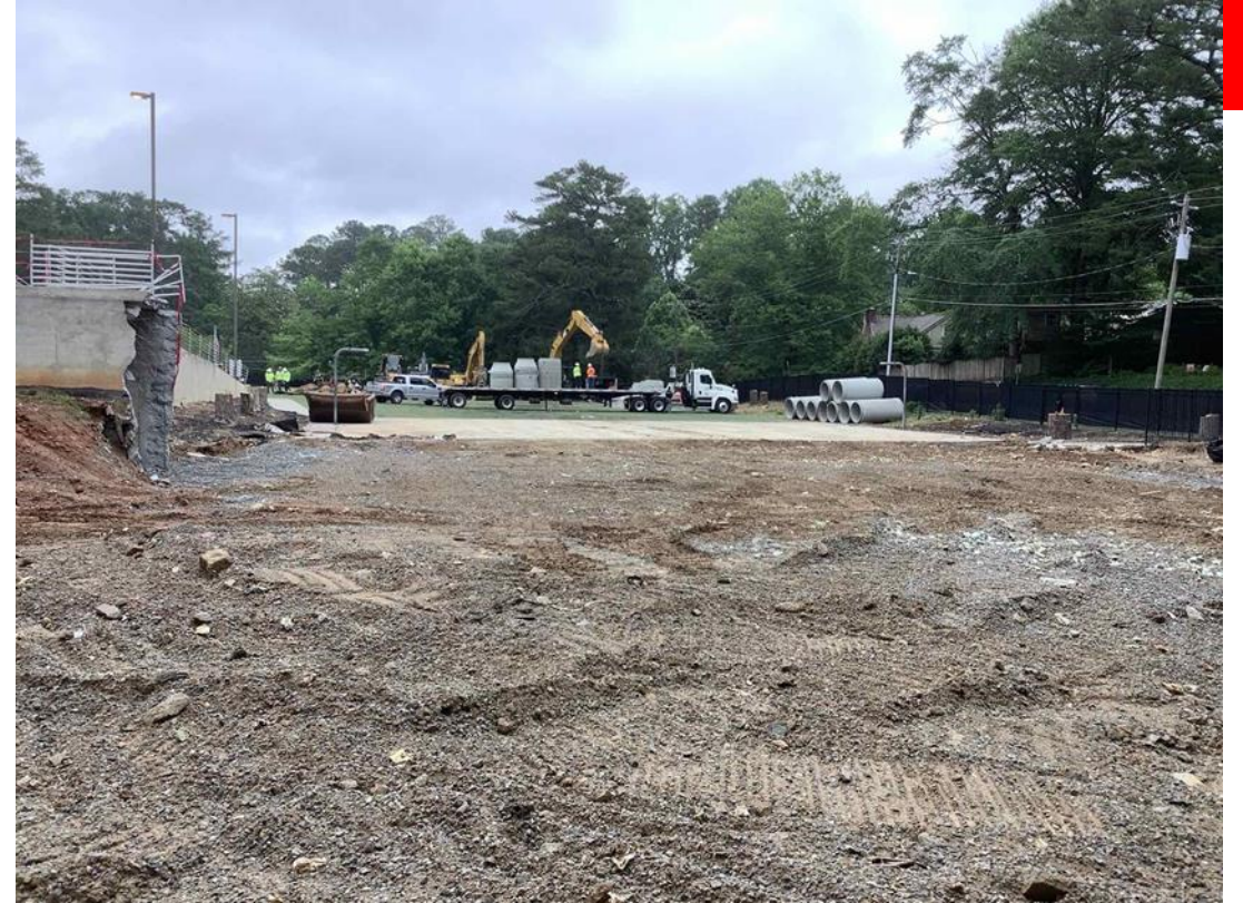
Existing gym building demolition complete