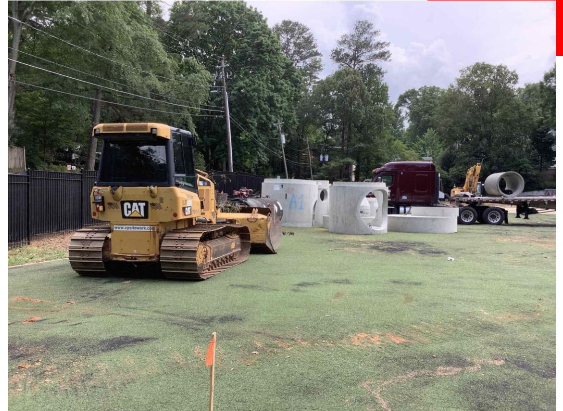
Storm structure delivery