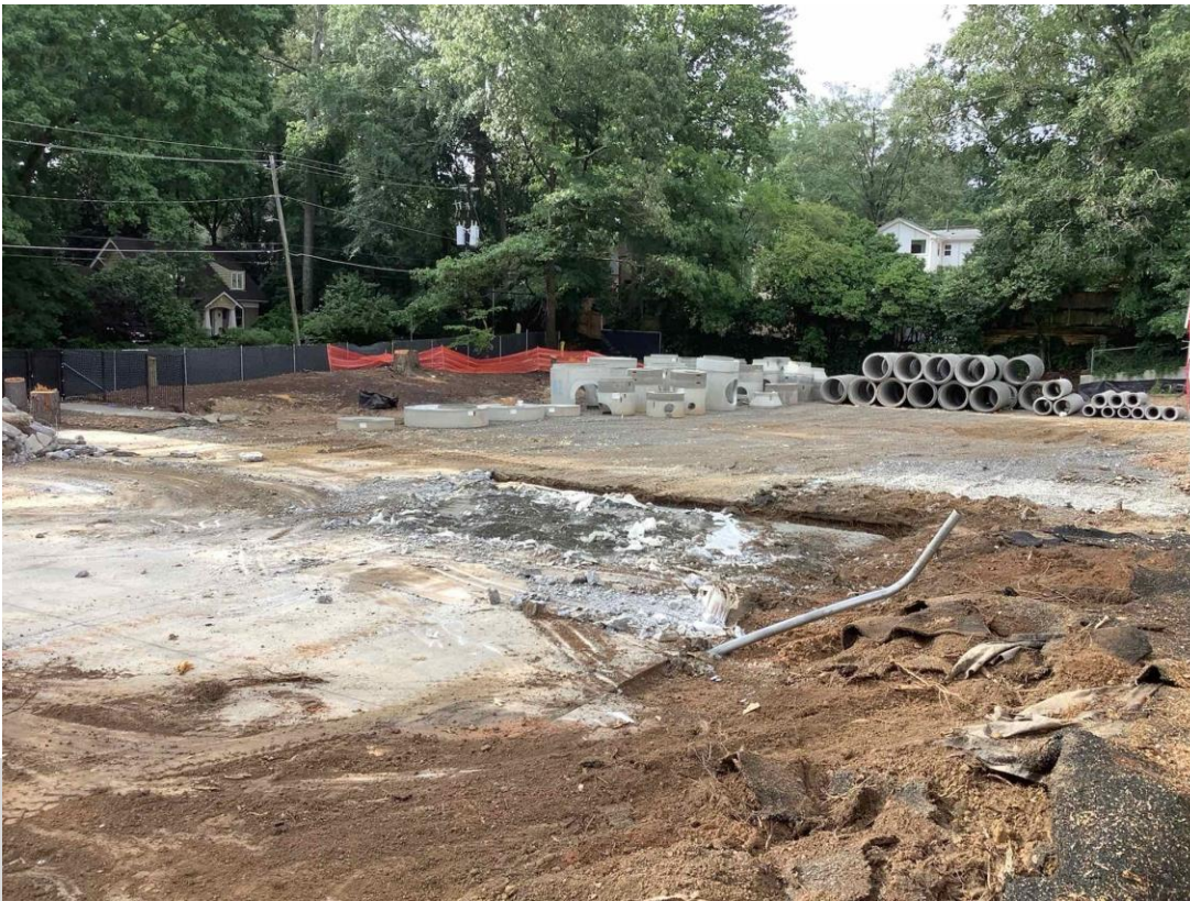
Existing gym building demolition complete