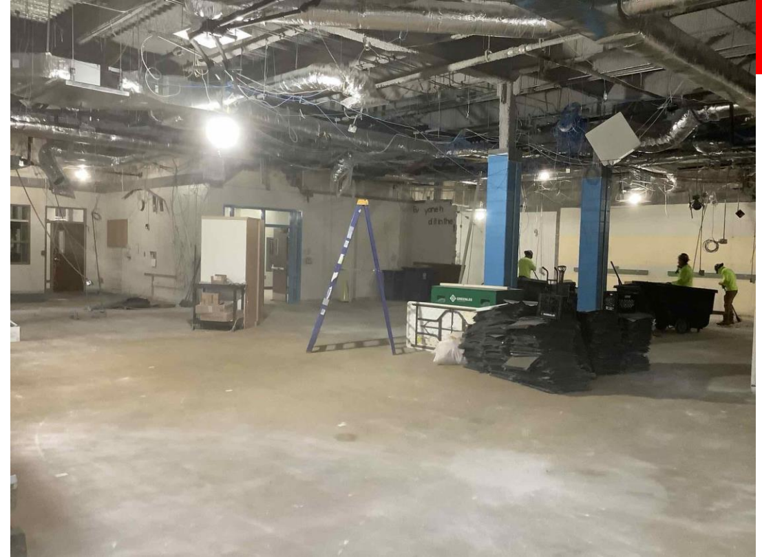
Interior demolition at media center